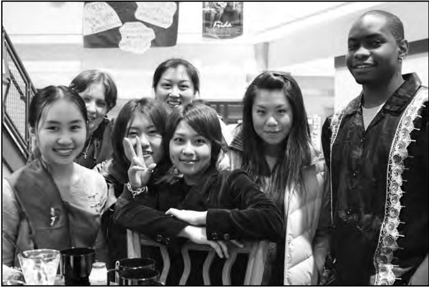
Students from all over the world form the Elizabethtown College mosaic.

and written materials. Prerequisite: Modern Language 211, or placement by examination. This course also fulfills the 200 level Foreign Culture International Studies requirement of the 1990 Core program. A Writing and Research Intensive Course.